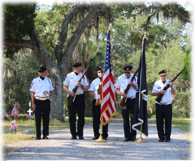
American Legion Post 186 Honor Guard at Aripeka Cemetery Ceremony