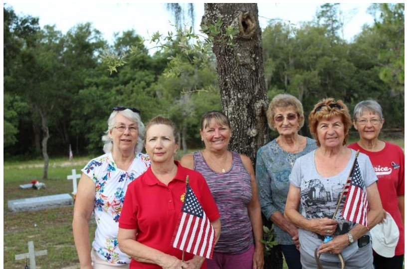
Aripeka Cemetery Flag Placement