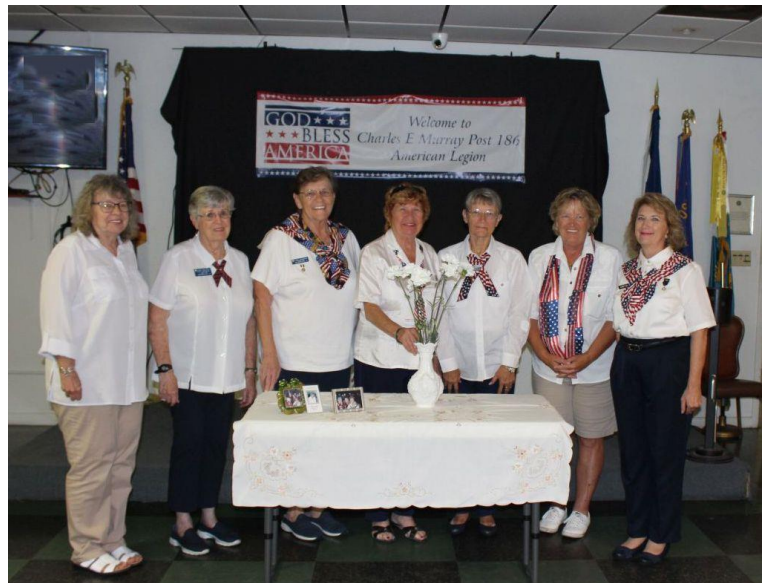
Post Everlasting - May 5, 2019