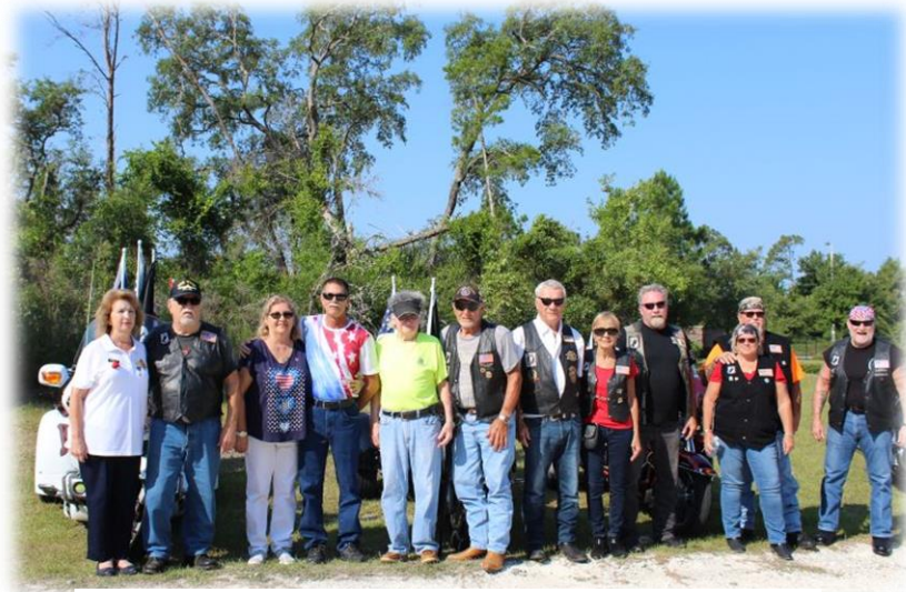
Aripeka Cemetery May 27, 2019