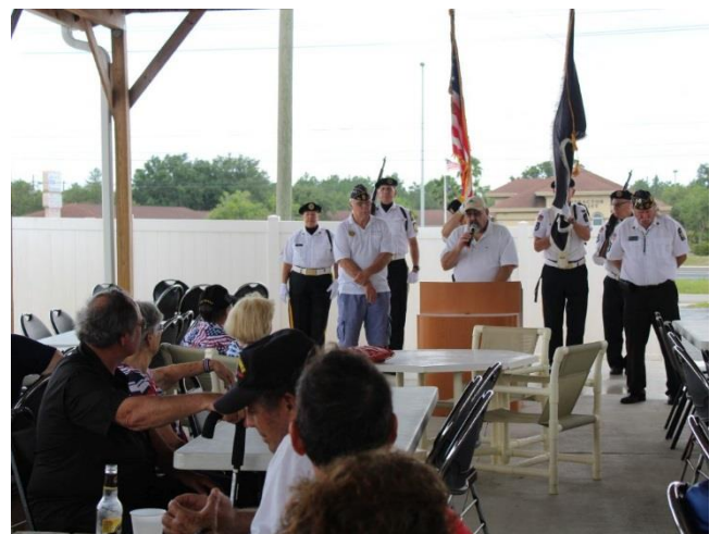
Memorial Day 2018 at Charles E. Murry Post 186