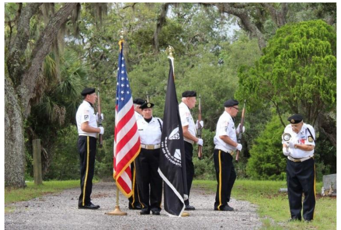
Aripeka Cemetery May 2018